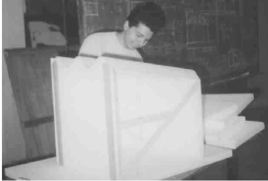
Image 1: Construction of a simulation model with expanded polystyrene

The tests in models constitute in a valuable tool for the architects designers, the scale models are light, of easy construction, relatively economic and in addition they offer the possibility of becoming laboratories of materials and projects (See Image 1).